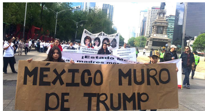
Asylum Access Mexico joining other NGOs in Mexico to call out human rights abuses against refugees carried out by the Mexican government.

Asylum Access Mexico (AAMX) has drawn international media attention to the ongoing human rights abuses against refugees by government officials. They have also testified against the 'Remain in Mexico' policy before the Inter-American Court of Human Rights, demanding an end to the policy and a humane refugee response from both the US and Mexico.